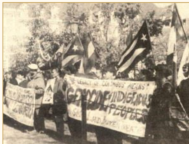
In 1992 Latino/a students and supporters occupied the Office of Minority Student Affairs and the Administration Building to demand reforms and resources. (Timeline, 1990-1999)

http://archives.library.illinois.edu/slc/researchguides/timeline/