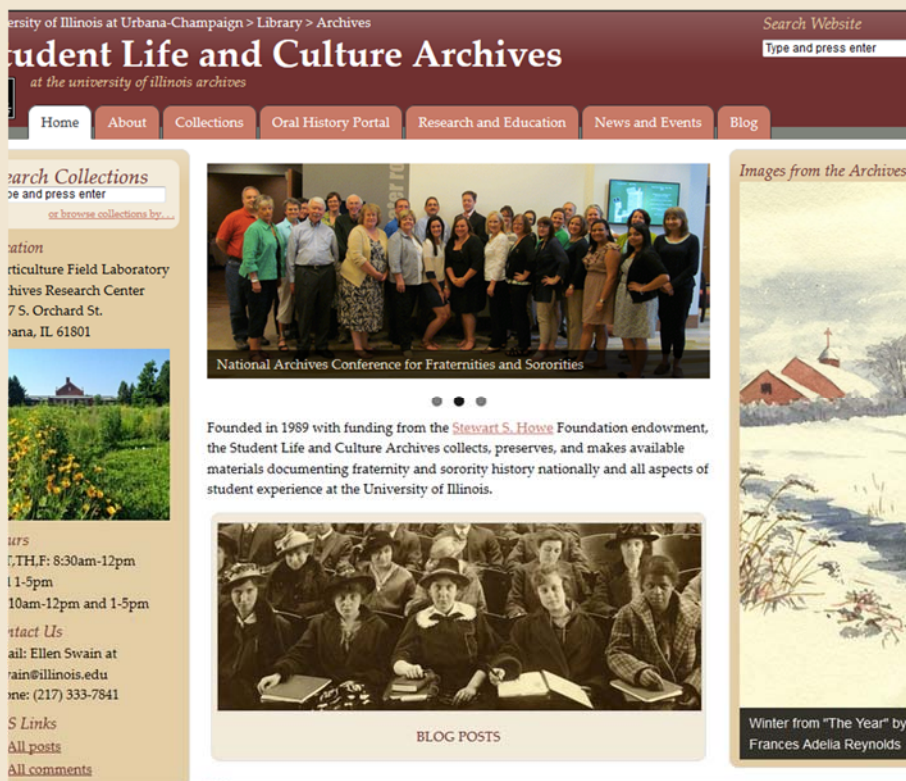
New Website Homepage