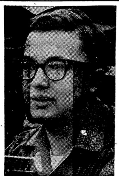
ROGER EBERT ... editor-in-chief

In recent years The Daily Illini also has won several awards in the Sigma Delta Chi student journalism contest.